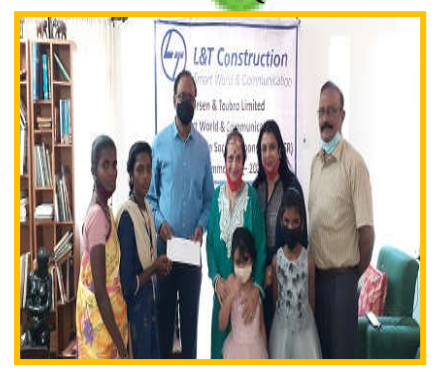
Scholarship was distributed to our EBN members children in Chennai

Pavement Dwellers Rehabilitation Program)