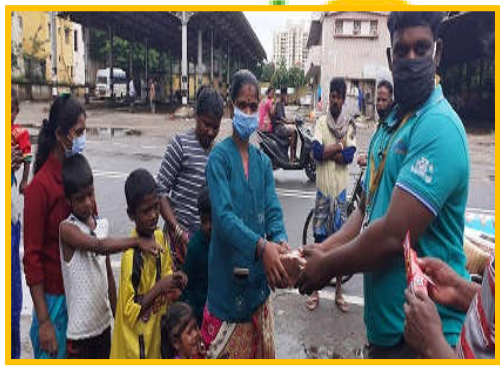
Food packets were distributed to the victims of Nivar cyclone in Ayanavaram