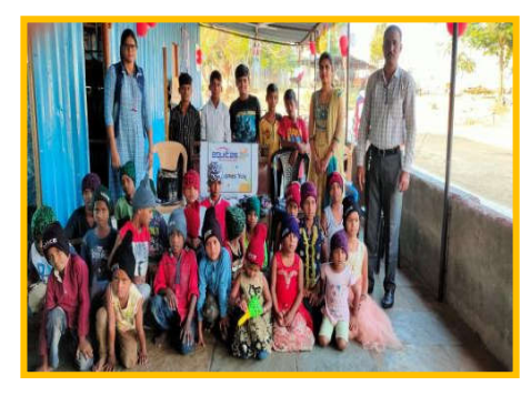
Socks & Caps were given to the children in the orphanage at Pune