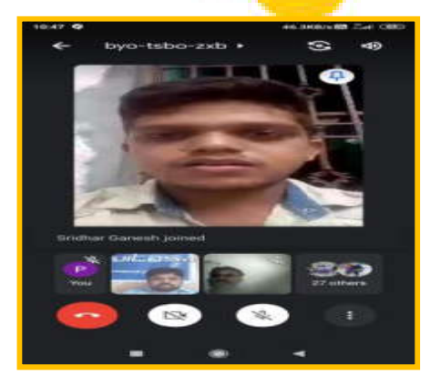
Virtual Jobfair at Chennai