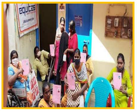
DAV Samrakshan Loan disbursement to PWD members in Kannagi Nagar,Chennai