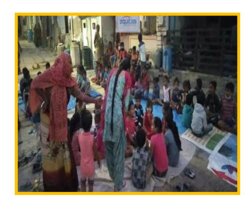
Sweets were distributed to orphanage children at Ahmedabad